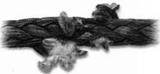
Rope displays two adjacent cut strands-- rope should be replaced.